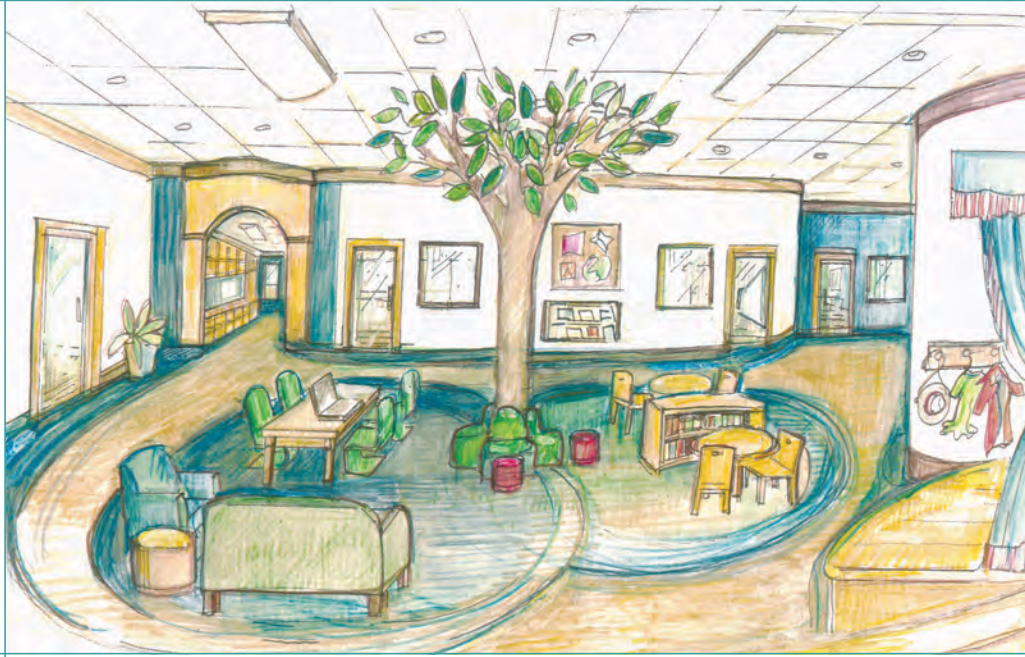
Media - Drama Center - Library